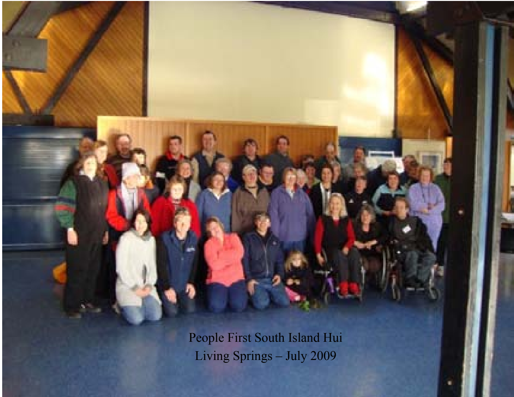
People First South Island Hui Living Springs – July 2009